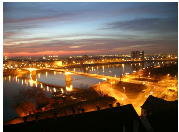
Night view of Novi Sad from the castle