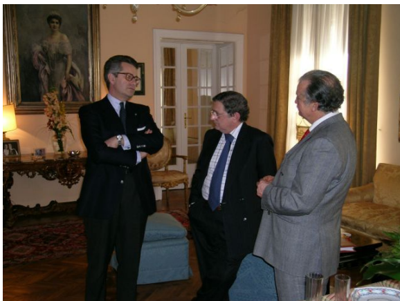
The delegation from Campania received by the Italian ambassador at Belgrade